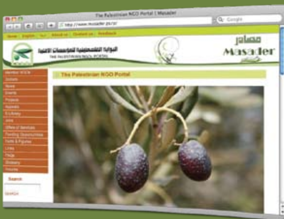
Masader Website: www.masader.ps

Established by the NGO Development Center (NDC), the Palestinian NGO Portal (Masader) is the first and unprecedented NGO Portal in Palestine and in the Arab world. Masader specializes in serving and empowering the NGO sector in terms of assisting NGOs in overcoming geographic limitations and providing them with opportunities for communicating amongst each other and among other relevant parties. Through Masader, member NGOs are able to publish and exchange their achievements (e.g. projects, studies, research, proposals, administrative and financial reports, etc.). Moreover, Masader exists as a current and concise resource for governmental, private, academic, and media institutions; assisting them to operate with a higher level of accuracy and professionalism. Finally, Masader provides donors, whether individuals or institutions, with the needed information in making funding decisions.