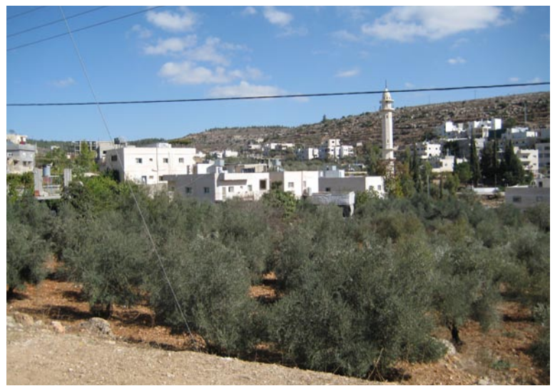
Wadi Fukin was destroyed twice, only to be rebuilt in 1972

It would have been very easy for the village of Wadi Fukin to have been erased. Caught in firefights along the armistice line between Israel and Jordan<sup>1</sup>, the village was twice demolished and in 1954, its residents forced out to Dheisheh refugee camp in nearby Bethlehem. Thirteen years later, Israel had occupied the area and began investing in settlement projects that swallowed up residents' agricultural lands.