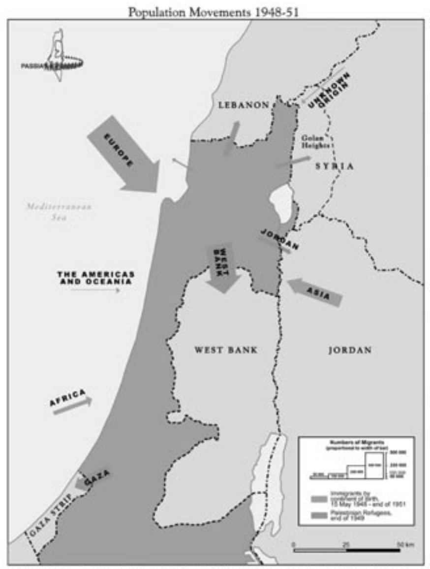
The Palestinian Academic Society for the Study of International Affairs PASSIA